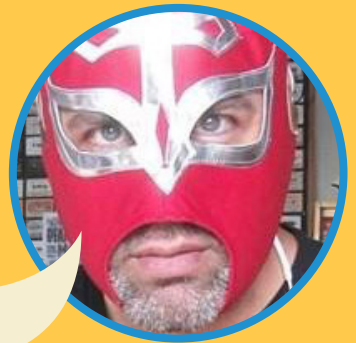
BOSS DUDE AT DEATH RAY RECORDS

"I have a stage on the curb outside the shop during Newtown Festival. It's rad. Really looking forward to seeing local D-Beat punk band, Rogernomix perform. Auckland's garage trash band The Bloodbags, droney noise eggs Church of Goya, acid psych babes Linen, kraut party gents the Spectre Collective and not on my stage Womb! Also forgot to mention Tidal Rave, Mermaidens, O-Boy, Totems and a whole lot more. So much more!!!!"